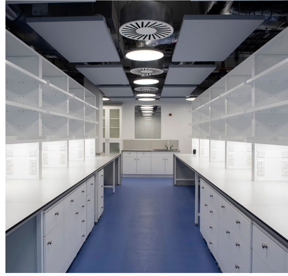
Newly built labs in Keppel Street before staff moved in

The UK Public Health Rapid Support Team, funded by the UK Government and jointly run by LSHTM and Public Health England, was deployed to three countries in 2018 to tackle disease outbreaks which had the potential to develop into major health emergencies. These were Nigeria (Lassa fever), Bangladesh (twice for infectious disease outbreaks in the Rohingya refugee camps), and the Democratic Republic of Congo (Ebola, two deployments).