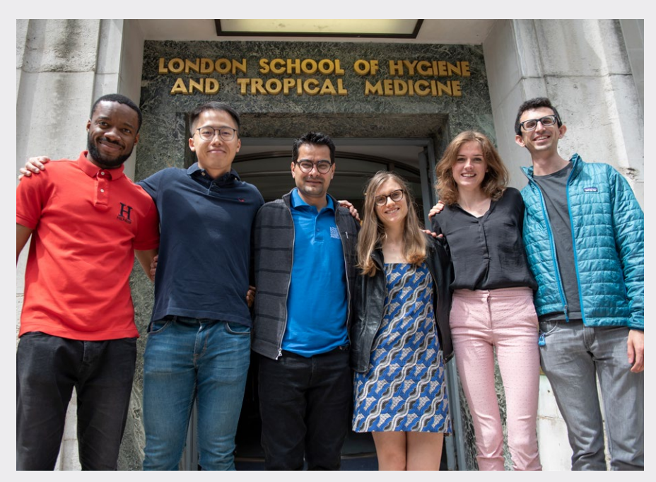
Our students in 2018 on the steps of Keppel Street, London

Our new Doctoral College launched in November 2018, establishing a focal point for doctoral training and early career researcher development. It provides our vibrant community of doctoral students with enhanced support and opportunities for training, development and networking.